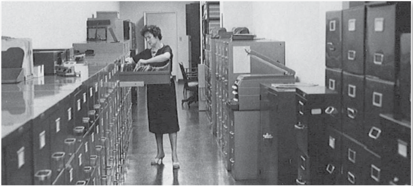
The file department at East 44th Street, which accommodated G.S.O.'s vast and growing correspondence.

doing this and doing that, and how are we going to stop 'em? They're trying to take A.A. away from us. . .'" The need to answer these anguished protests led to the writing of A.A. Guidelines, a distillation of A.A. experience on a given subject, which could be sent instead of a lengthy letter. Guidelines were developed on treatment centers, court programs, armed services, A.A. members working in the field, and other topics of interest to the Fellowship. Still a staple in G.S.O.'s service arsenal, today's Guidelines are written and revised as experience filters in, sharing the most up-to-date information available throughout the Fellowship.