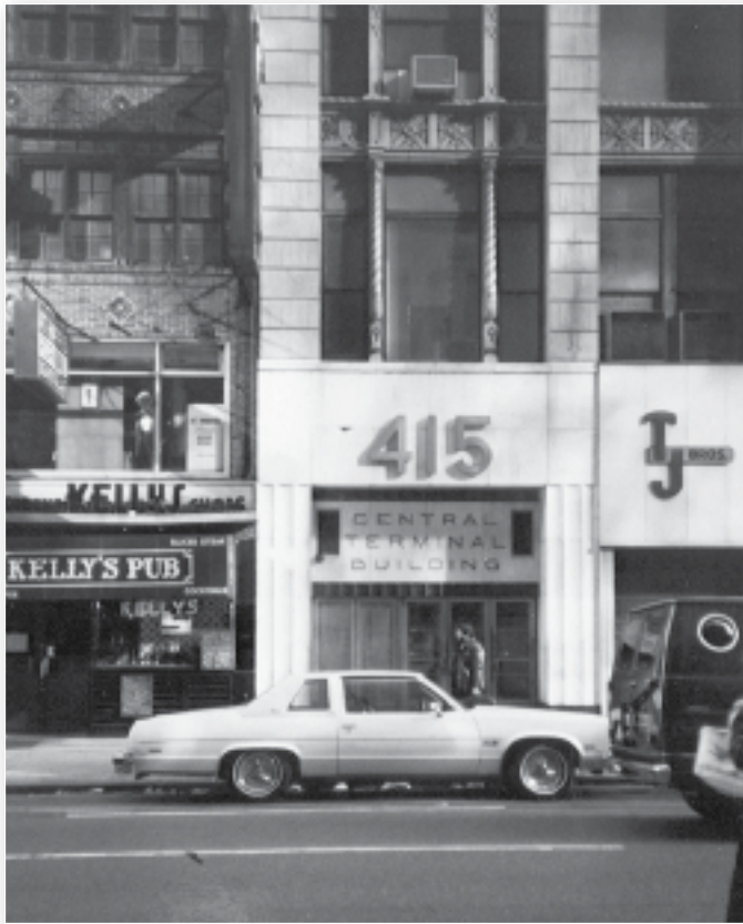
415 Lexington Ave. (43rd Street). Manhattan. A.A. headquarters operated here in Grand Central Area from about 1944-1950.

profits from sales of the Big Book, an appeal was now made to the A.A. groups to help pay for this enormous Twelfth Step job. The groups responded and as funds flowed in they were collected in a separate account, earmarked for A.A. office expenses only.