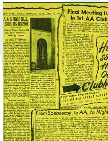
In a failed effort to revive the Old 24th Street Clubhouse in New York City, which closed in 1960, A.A. members put together this flier.