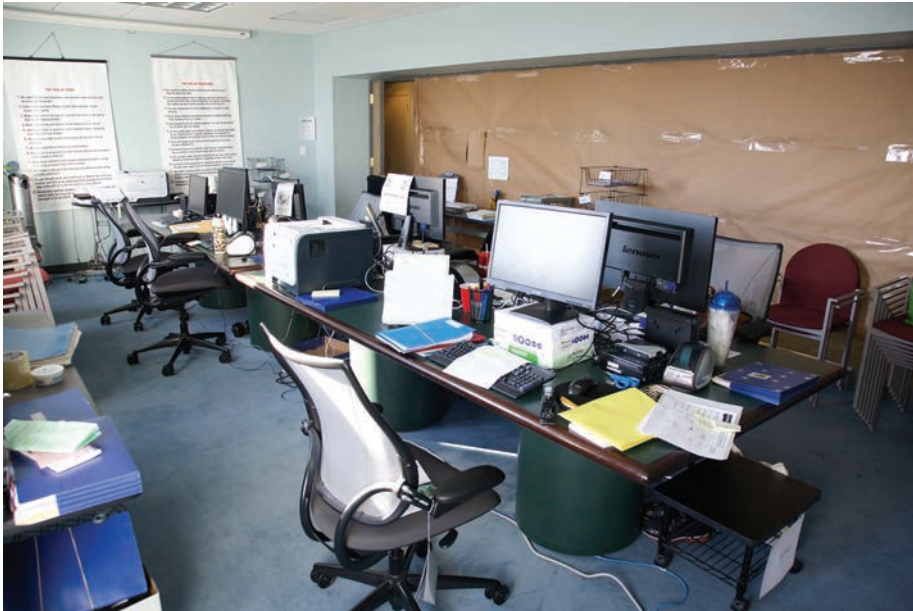
The former Conference room was used as a 'swing space' for various departments and employees who were temporarily relocated pending completion of their new area. A new and larger Conference room is under construction.