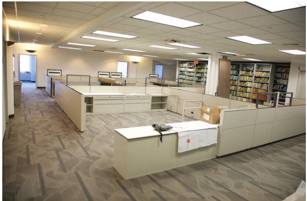
Records department workstations near completion.

So, it is expected that by the end of the year the construction will come to a close; new workstations and offices will be repopulated; favorite pictures of family and friends that have been stashed away in boxes since the end of summer will reemerge on employees' shelves, desktops and workspaces; the Friday Morning A.A. meeting will return to the new and larger Conference room; and tours will pick up for A.A. visitors from near and far, making the office available once again to the Fellowship it so dearly serves.