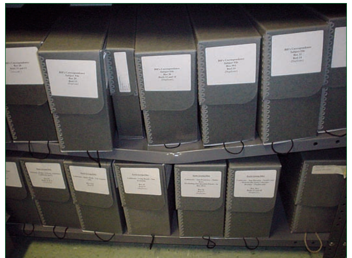
These bowing shelves, which line the vault at G.S.O. Archives and hold the corporate records of Alcoholics Anonymous, are due for replacement in the reconstruction project.

There will be limited displays in the G.S.O.'s reception area for visitors.