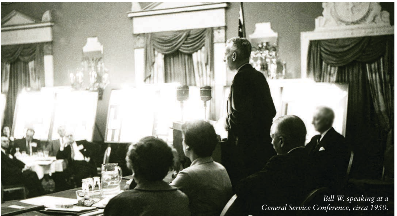
Bill W. speaking at a General Service Conference, circa 1950.