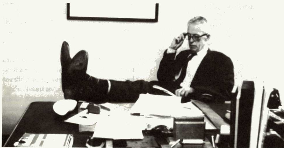
Late Illinois Governor Adlai E. Stevenson, whose shoes became his hallmark of fame, you might say, had nothing on A.A. co-founder Bill W. Above, Bill sits comfortably in his old G.S.O. office on East 45th Street, New York, oblivious to his need of a shoemaker's services — at least until he went out in the rain. The year was 1966 and A.A. was 31 years old.