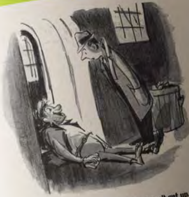
"I'm not powerless over alcohol. I just can't get up." — A Rabbit Walks Into a Bar