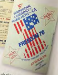
ICYPAA posters through the years.