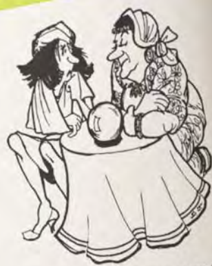
"Who cares about the future — where the hell was I last night?" — A Rabbit Walks Into a Bar