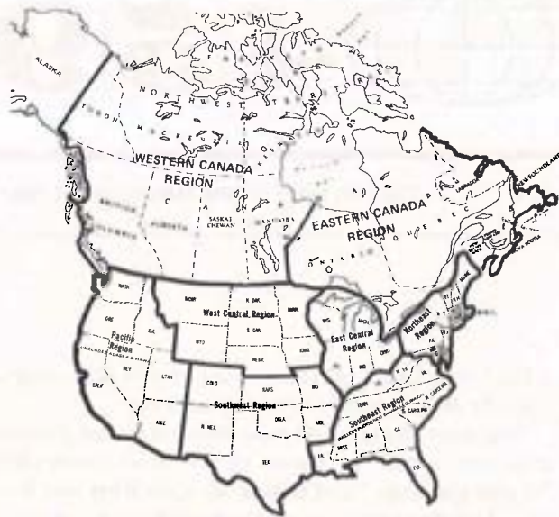
What's your A.A. region? Find your state or province here. The eight regions of the U.S. and Canada are outlined on this map, which is seen in a larger size on p. 97 of "The A.A. Service Manual"; still larger, on the inside front cover of the Final Conference Report.