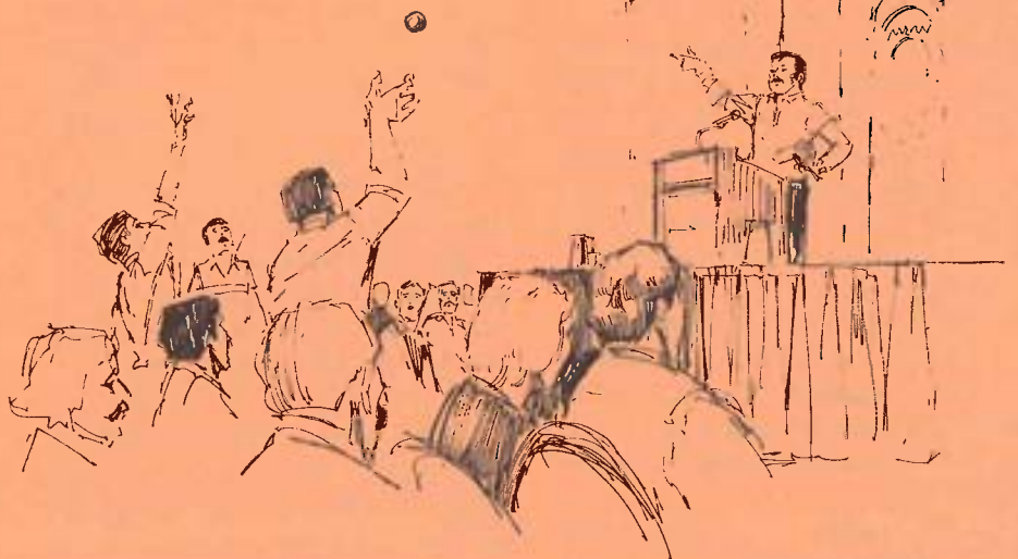
Reunión de Español, July 4— catch the red ball and speak up next

A.A.'s, there were shrieks of delight as old friends met; new friendships began all over the city.