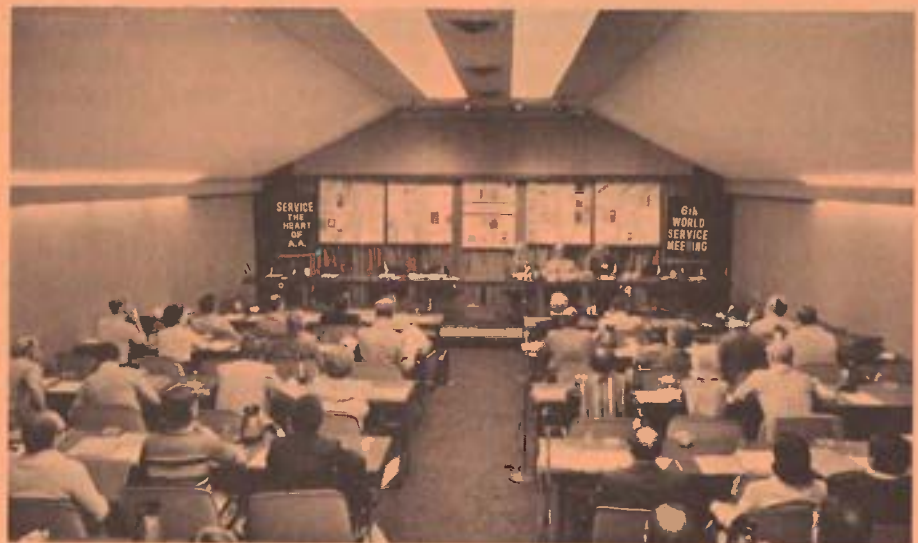
Some World Service Meeting delegates are nonalcoholics, like the three panelists here.

A striking fact that emerged was the similarity of growth patterns in different places, nearly (continued on p. 2)