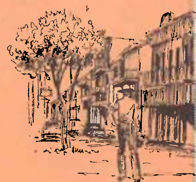
Workshop "The Gra How It W