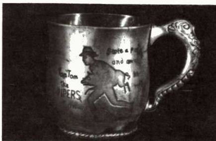
Baby Cup engraved: "William G. Wilson, Born East Dorset, Vt., Nov. 26, 1895." This was believed given to him by his grandmother Wilson.