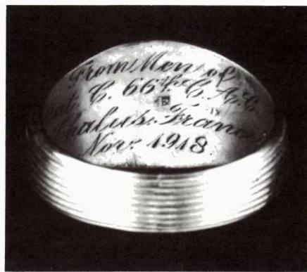
Inscription reads: "From Men of Bat. Co. 66th C. A.C., Chalus, France Nov. 1918"