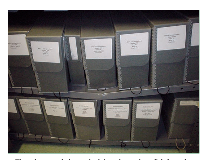
These bowing shelves, which line the vault at G.S.O. Archives and hold the corporate records of Alcoholics Anonymous, are due for replacement in the reconstruction project.

There will be limited displays in the G.S.O.'s reception area for visitors.