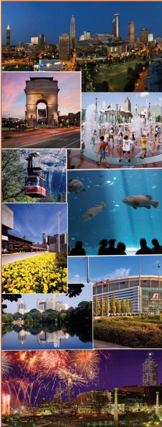
Box 4-5-9, Fall 2011