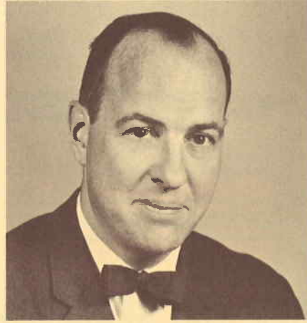
VINCENT DOLE, M.D.