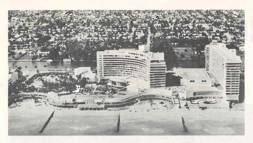
Fontainebleau Hotel, Miami Beach, Convention Headquarters