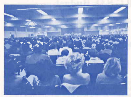
Scene from proposed film guards anonymity.