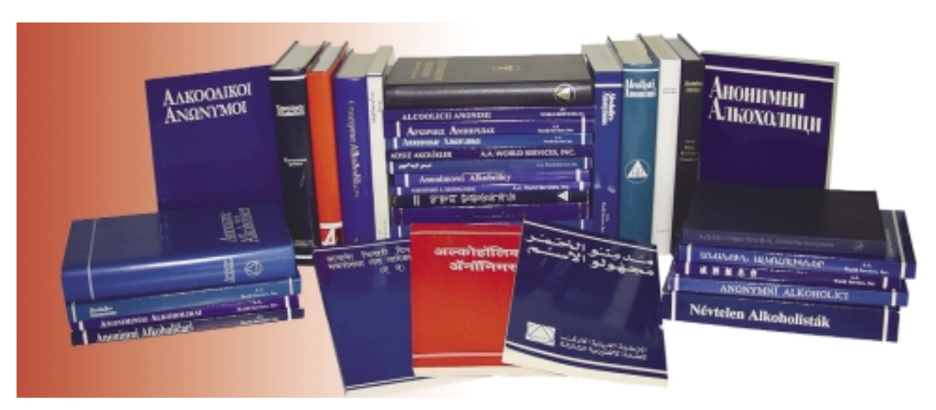
Today the Big Book is translated into 43 languages, with more being done every few months.

"And, we reflected, we'd have to get some kind of literature. Up to this moment, not a syllable of this program was in writing. It was a kind of word-of-mouth deal, with variations according to each man's or woman's standing. In a general way, we'd say to a new prospect: 'Well, the booze has got you down, and you've got an allergy and an obsession and you're hopeless. You'd better get honest with yourself and take stock; you ought to talk this out with somebody, kind of a confessional, and you ought to make restitution for the harms you did. Then you pray as