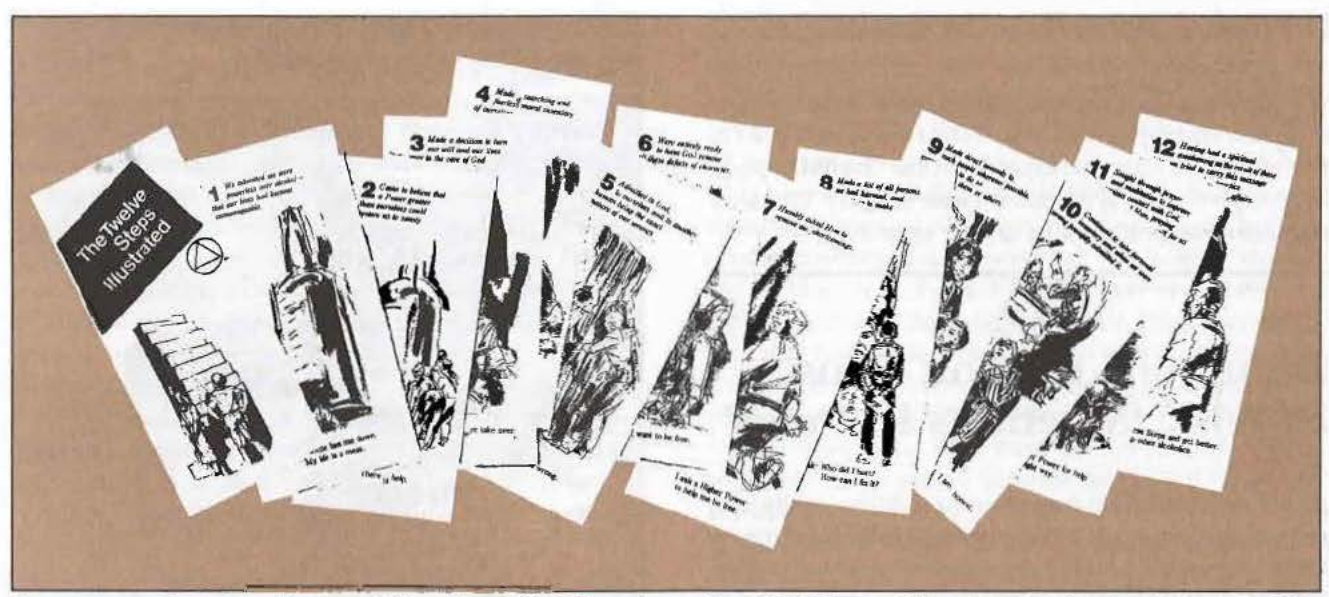
In response to a growing need for simplified literature, the 1991 General Service Conference approved the "Twelve Steps Illustrated" pamphlet. The actual Step appears at the top of the page, with an easy-to-read interpretation beneath the illustration. Now available from G.S.O., (P-55).