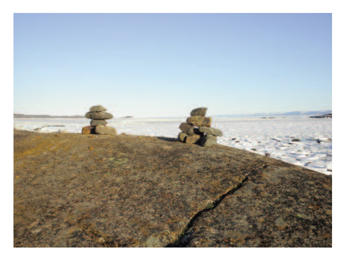
Inuksuit (Inukshuk, singular) were forms made from unworked stones that were used by the Inuit for communication and survival; they were formed to give directions, warn of danger and various other messages.