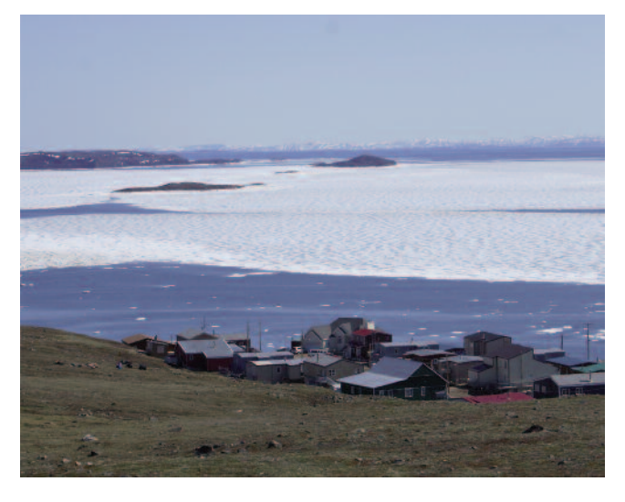
The community of Iqaluit on Iqaluit (formerly Frobisher) Bay.

A call for help came in nearly 18 years ago in Area 90 (NW Quebec) from an Inuit alcoholic in the remote community of Nunavik. Like the spiritual chain reaction described by Bill W., of one alcoholic reaching out to another, this call put into motion a series of events fueling the slow spread of A.A. across the land of the permafrost, ultimately bringing together more than 40 alcoholics, friends and family members at the first Eastern Arctic A.A. Convention for two days of sharing, most of it conducted in Inuktitut, the native language of the Inuits.