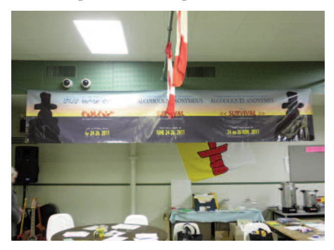
The Conference room, where the meeting took place, with the banner in Inuktitut, English and French.

The convention began on June 24th with a ceremonial lighting of the Qulliq (an Inuit lamp) and welcoming remarks from the mayor of Iqaluit. The D.C.M. of District 27 and the convention's chairperson also addressed the group, with featured speakers from both A.A. and Al-Anon sharing in their native tongues.