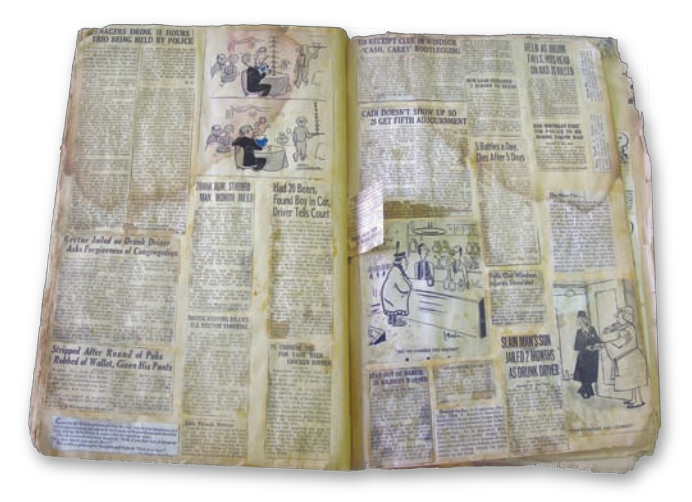
This scrapbook from the 1940s shows the ill effects of poor preservation, with glue stains, clippings fallen loose, and frayed edges. Also, lacking publication names and dates, these clippings are of only limited use.

Newspapers feature prominently in the history of Alcoholics Anonymous. In the early years of the Fellowship, newspaper stories about A.A. helped spread the word to those looking for a way out of alcoholism. These accounts of A.A. in newspapers are valuable resources that merit special attention by archivists.