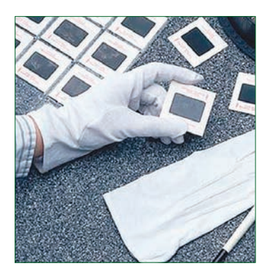
Proper handling of slides and other archive images is key to their preservation.

that may be out-of-focus, poorly shot, or redundant. Eliminating these makes the job of preserving the important photographs much easier.