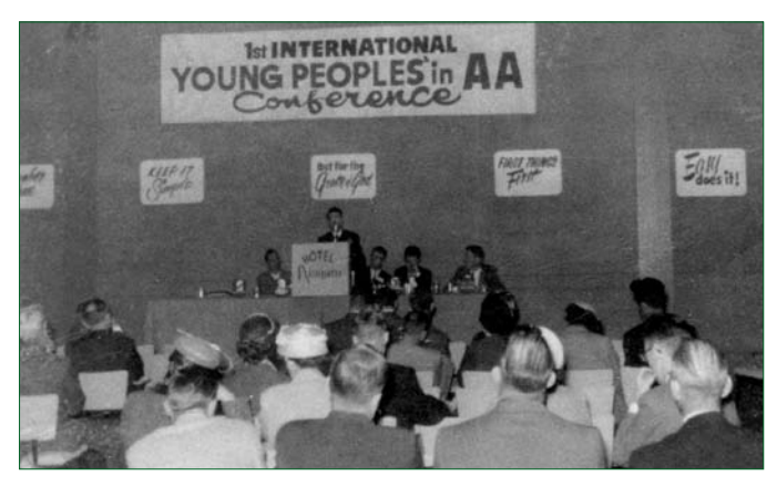
This photo of the first International Young People in AA Conference, which was held April 1958 in Niagara Falls, New York, is among the ICYPAA archives materials donated by the organization to the G.S.O. this October.

In October of this year, the International Conference of Young People in Alcoholics Anonymous (ICYPAA) formally donated its archives materials to the General Service Office Archives, to better preserve and offer access to these historic documents. We are creating an exhibit of some of the treasures in this collection, which will be on display at G.S.O. for several months beginning in December. We will continue to work with ICYPAA in the coming years to ensure that important ICYPAA archives being created today will survive for the future. The GSO gratefully acknowledges the work of the ICYPAA Council in helping to coordinate this contribution.