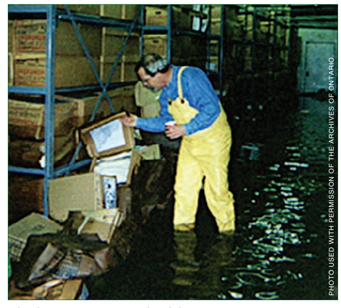
Flood waters in 1997 inundated this storage room at a Records Centre of the Archives of Ontario in Canada, causing irreparable damage.