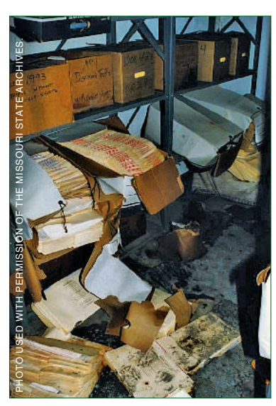
Charred files after a courthouse fire in Mississippi County, Missouri.

Even with a small fire, use caution and get help. If you decide to use an extinguisher to fight the fire, remember to stand back about 8 feet, pull out the pin, and aim low , at the base of the fire. Not only will this put the fire out more