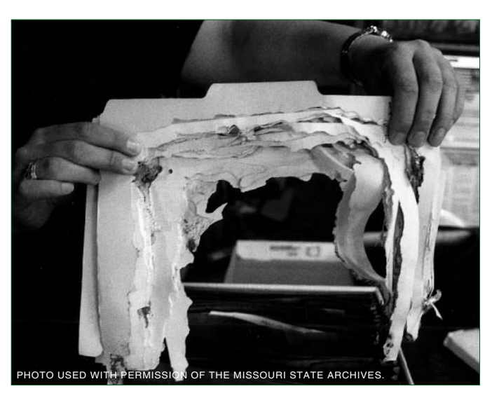
Bugs feed on paper, bookcloth, leather book bindings, and adhesives. Shown here is what termites did to documents at the Missouri State Archives

It's a good idea to invest in a few adhesive pest traps – these are simple and cheap – and place them in the corners of your archives room. This way you can monitor your insect population and better determine if you have a potential problem.