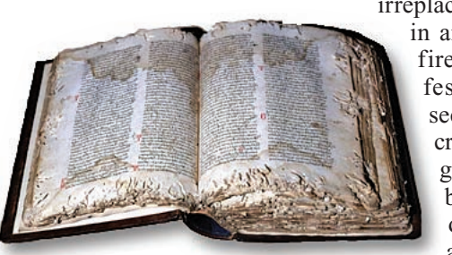
This book was destroyed by insects, one of a number of threats facing archival holdings.

A burst pipe or a hastily discarded cigarette can wreak havoc in archives, damaging or destroying records that are literally