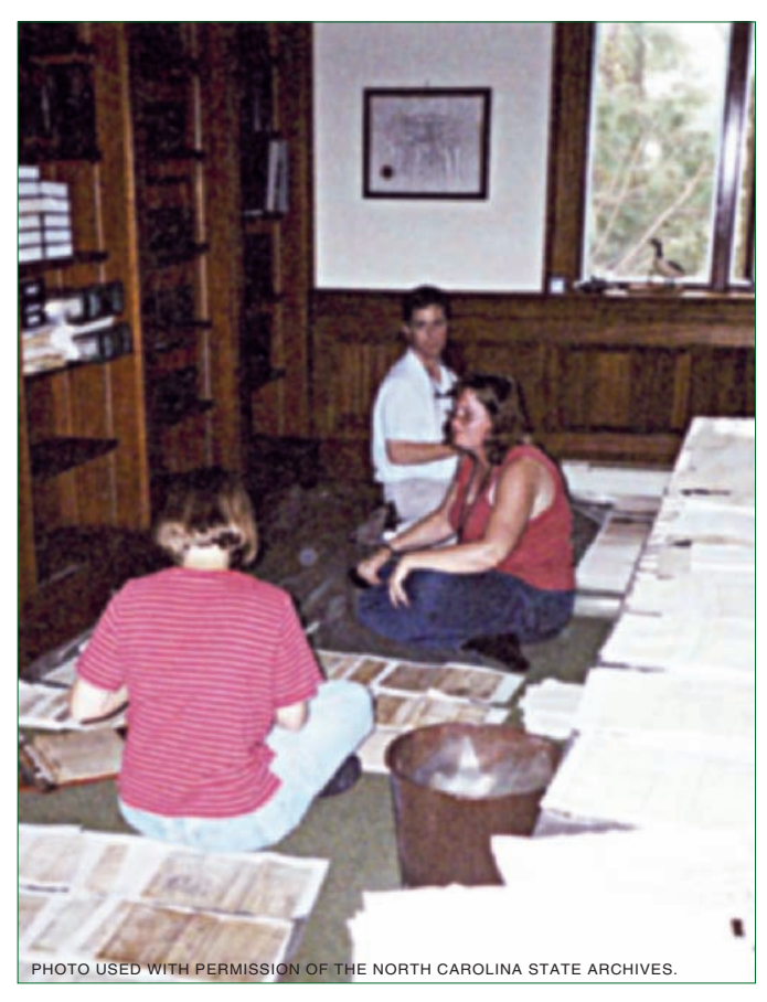
With mold a critical threat following water damage, archivists at the North Carolina State Archives work to air-dry wet documents in the wake of Hurricane Isabel in 2003.

Recovery of Wet Materials — First of all, materials in archival boxes often fare relatively well in flooding situa-