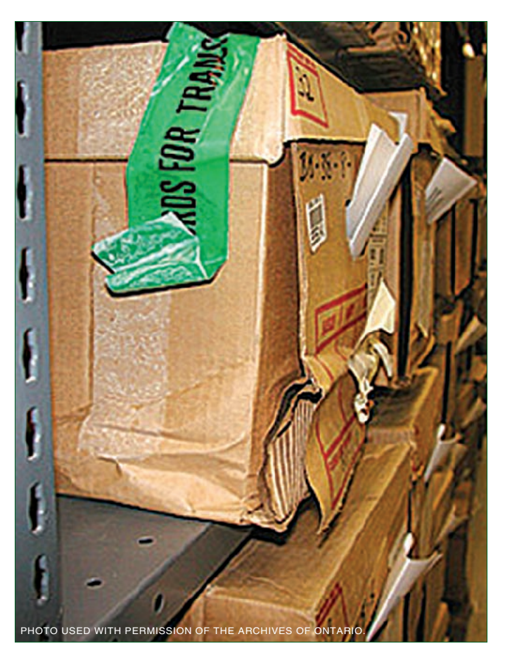
Avoid stacking cardboard boxes more than three high to keep them from collapsing should they become wet. Shown here is a water-damaged box at the Archives of Ontario.

In addition, clean-up will be affected by whether the powder