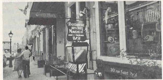
Gift shops and good food invite visitors to the Old Montreal section. (Never mind those other "attractions"—New Orleans had plenty, too.)

"What really gets to me," she says, "are the letters from teenagers. One 14-year-old from Connecticut wrote, 'I have a problem with alcohol and want to run away but won't, because then nobody will care for my dog.' We receive such letters every week."