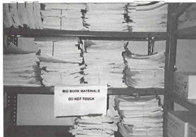
Stacks of 4th Edition stories in storeroom, waiting to be processed.