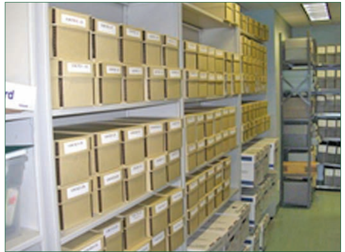
Organizing and cataloging material so that it can be accessed are among the main functions of archivists. These acid-free boxes are stored at the G.S.O. Archives.

Conservation is a professional field in its own right, quite distinct from archives. A conservator is someone who, through specialized education, knowledge, training, and experience works to repair, restore, and conserve documents, books, film, photographs, artwork, and more. Conservators are trained for years to perform treatment on items that are damaged or fragile, and need stabilization. They clean, mend, and sew, using special tools, supplies and chemicals. Some of the work they do is quite sophisticated.