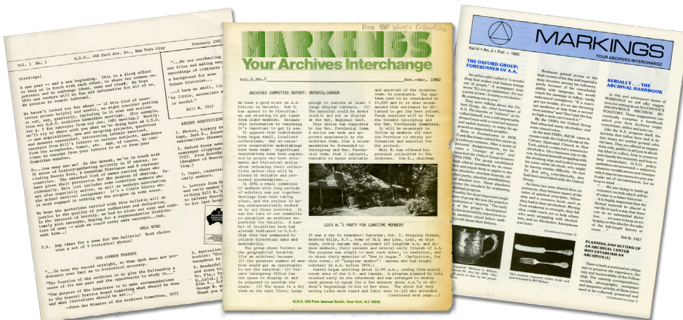
The first issue, shown here far left, was 10 pages long and did not yet have a name. Issue No. three, in the middle, appeared in 1982 and bears the name Markings , which was supplied by a reader. The Fall 1985 issue features a new look and an article on the Oxford Group.