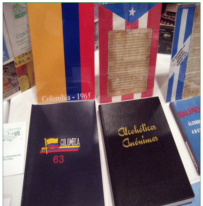
A collection of early Hispanic A.A. literature exhibited at this year's 13th Annual NAAAW. Exhibits are supplied by attendees, who use the opportunity of the event to showcase samples of their holdings.

(Visit aanationalarchivesworkshop.com for more information about the Archives Workshop.)