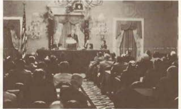
Delegates at General Service Conference

But it's now a matter of record that the Conference has done an amazing job of helping A.A.'s "carry the message" better when one drunk first sits down at the