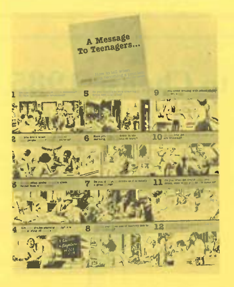
"A Message to Teenagers . . . "above is opened out to show series of cartoon depictions of teenage alcoholics.

of this flyer is that it can be distributed free, and therefore ingreater numbers, to teenagers. A.A.'s who give P.I. talks in schools may find it especially useful.