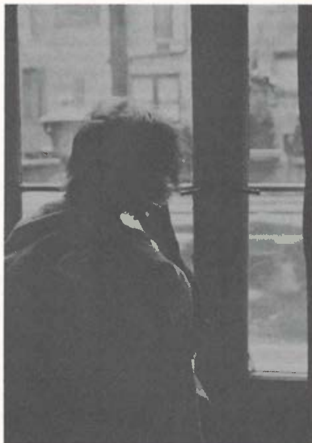
"Almost without exception, alcoholics are tortured by loneliness."— Bill W.

As Bill W. said, "Almost without exception, alcoholics are tortured by loneliness"—and LIMs, confined by illness or handicaps, feel it more than most. In the Fellowship, life takes on new meaning. Like more mobile A.A.'s, LIMs "watch" their fellow alcoholics recover through correspondence, phone calls, meetings by tape, and A.A. literature. They help others, make fast friends in the process, and stay comfortably sober. Herewith a sampling of correspondence showing how LIMs have been able to turn walls into windows that are open to life: