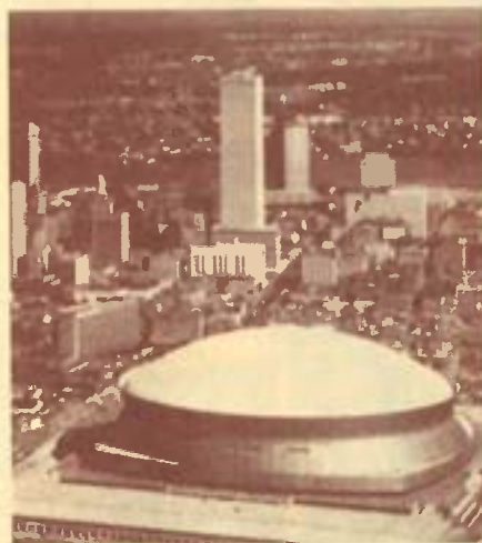
Convention focus: the Superdome

The thousands of us thronging the Queen City of the Delta today can only pray we will do half as well!