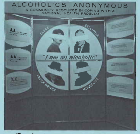
(Professional Showings only)

And once again, as we hear so often in our recovery stories, we re-