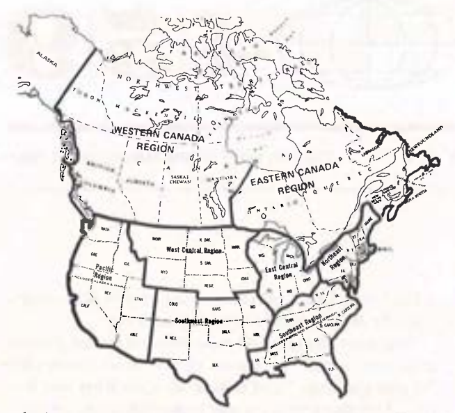
What's your A.A. region? Find your state or province here. The eight regions of the U.S. and Canada are outlined on this map, which is seen in a larger size on p 97 of "The A.A. Service Manual"; still larger, on the inside front cover of the Final Conference Report.