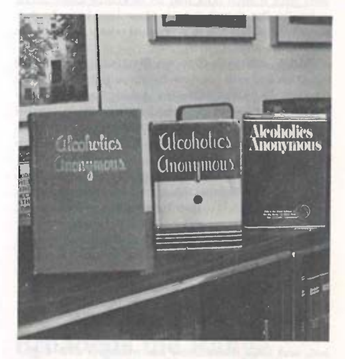
Big Books in the A.A. archives at G.S.O. convey an unchanging program in a changing world. The first printing (1939—left) was the biggest book of all, 2" thick, with ample margins. The eighth (1945—center) was the slimmest, 1" thick, with narrow margins, to meet wartime regulations for saving paper. Today's is a practical 1<sup>3</sup>/<sub>8</sub>" thick—but big as ever in its clarion call to recovery.

Give up (or better yet, surrender)? Yes, it's the treasured "Alcoholics Anonymous" — or "Big Book," as it has come to be known by alcoholics in 110 countries throughout the world. To honor its standing as one of the most successful hardcover best-sellers of all time, we thought you'd like to recall with us some of the facts and figures and history of the book that saves lives.