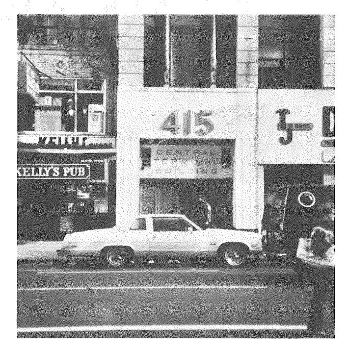
415 Lexington Ave.

selected the office because it was located as close to the post office as he could get.