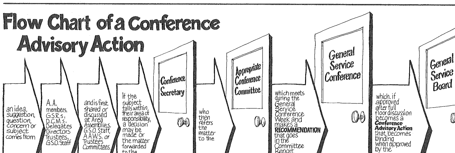
"Were it not for committees, it is doubtful that any Conference could get over a fraction of the ground it now covers. As the Conference has grown in size and influence, the committees' importance has grown even more." ("The A.A. Service Manual," p. 72)