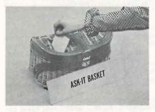
After about 30 Conferences, the creel is an oldtimer