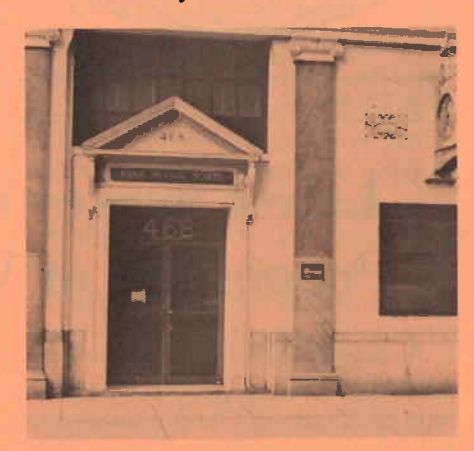
G.S.O. OPEN HOUSE NOV. 4

New Orleans can be one of the great A.A. memories of your lifetime, if you start planning for 1980 now—one day at a time!