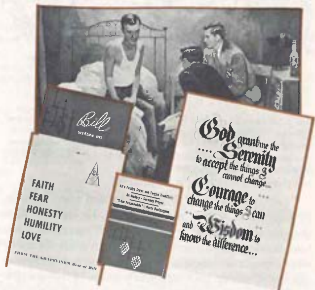
Just a few of the items in the new GV package.

Following up on a recommendation of the 31st General Service Conference, the Grapevine has put together a