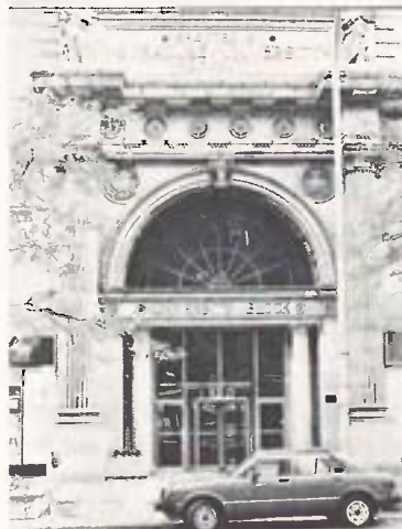
At 120 E. Washington St., Room 327, in Syracuse, N.Y., a welcome is waiting (article at right).