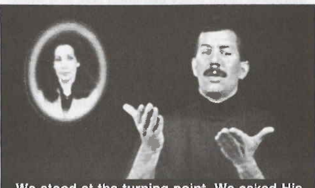
We stood at the turning point. We asked His protection and care with complete abandon. Here are the steps we took, which are

The 48-minute color cassette maintains total accuracy and integrity to Chapter Five. In a reversal of the usual procedure, the sign occupies the main part of the screen, with the voice translator positioned in the "magic window" at the top. The exact text is clearly