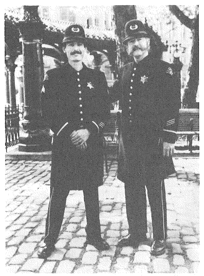
Seattle policemen, dressed in 19th century costumes, patrol the city's historic Pioneer Square area.

"The Convention theme is 'Fifty-Five Years—One Day at a Time,' " Eric observes, "and although there is an enormous amount of work to be done, we're really