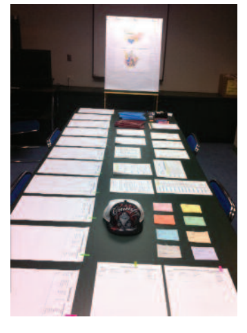
The Conference Committee selection process takes place in December for the annual General Service Conference. The names of new delegates are drawn from the hat to replace outgoing delegates on each committee. This photograph illustrates some of the preparations involved in the process.

In the midst of all the preparations and local discussion of agenda items, it may appear to some onlookers to be "more of those darn politics," but to those attend-