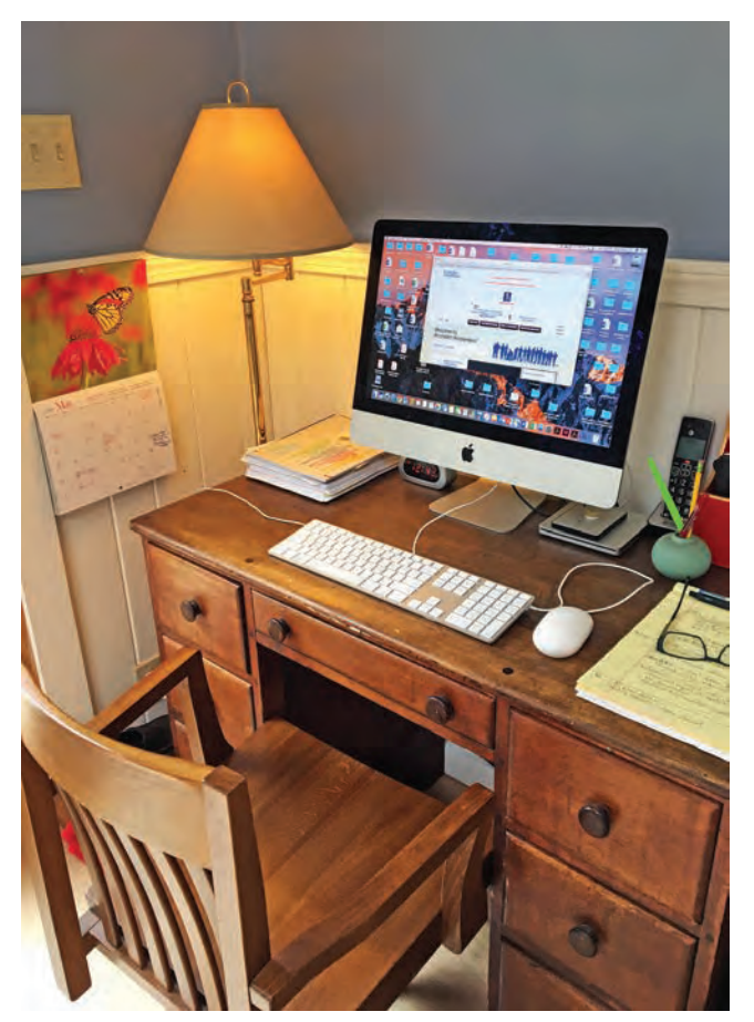
Teleworking from home — one employee's set up, including secure access to the office-wide VPN (virtual private network).

Among the many current publishing projects moving forward is the 2020 catalog of Conference-approved literature and other A.A. material (with new, simplified pricing) — 110,000 copies of which have been printed to be inserted into all orders from A.A.'s literature warehouses. (It is also available as a PDF on aa.org). Newly produced audio book recordings of the Big Book and