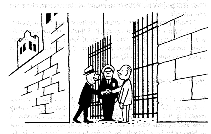
From A.A. in Prison: Inmate to Inmate Copyright by the A.A. Grapevine; reprinted with permission.

"By 1960, A.A. in prison had gone international, with seven groups in Finland and two in Holland. The Fellowship was lauded widely as a 'twentieth-century miracle' that could make the difference in the transition from prison to freedom."