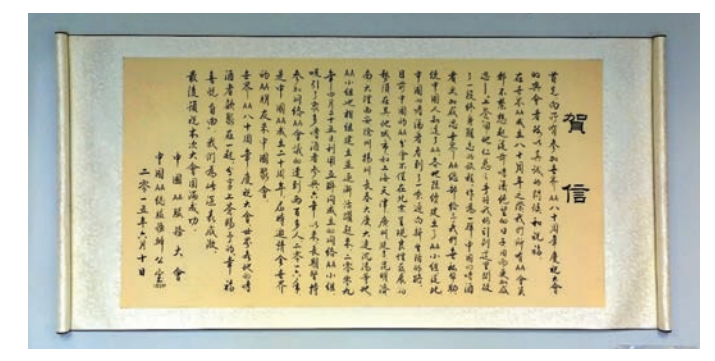
China presented the General Service Office with a beautiful Chinese language-scroll with a message from the Chinese General Service Office, which read, in part: "As Chinese alcoholics, we are grateful that A.A. headquarters has given us so much selfless assistance, and now more and more Chinese people have known A.A. Many A.A. groups have been established in the country; since then, alcoholics in China have seen a new way to our life."