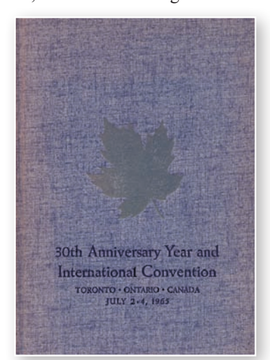
Souvenir book for the Convention in Toronto, which was the first held outside the United States.

The organizers were mindful of the impression that A.A. would be making, as indicated by a memorandum from the Convention Committee to the Public Information Committee dat-