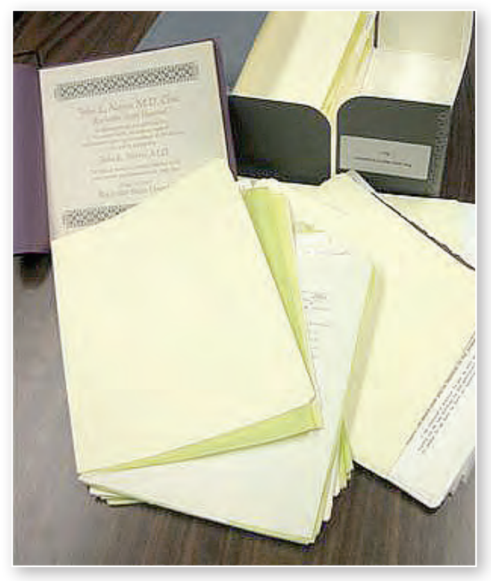
Finding aids simplify the task of filing and accessing the mass of documents found in collections. An effective finding aid will describe the contents of the collection while also providing historical or biographical background.

While the collection itself may provide a sufficient amount of information for this area, it may be necessary to seek outside sources to describe the subject in question. If you do need to use outside sources, be sure to provide proper citations to indicate where you acquired the information.