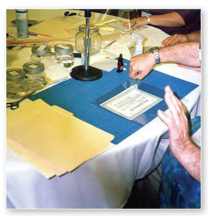
One all-day workshop at N.A.A.A.W. was titled "Conserving and Preserving," at which attendees had the opportunity for hands-on experience with the work of ensuring that A.A.'s artifacts and documents are safely stored.

On Saturday night, the group got a real taste of Southern hospitality when they drove to Lake Tobesofkee and dined on the best barbeque and catfish in the area at Fish 'n Pig. Bluegrass and Southern harmony brought out the smile in all who attended.