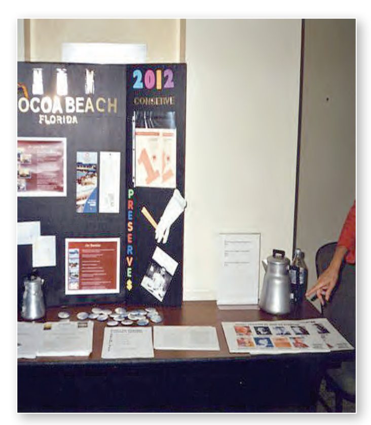
This exhibit from Cocoa Beach, Florida, was one of several set up by local archivists from around the country who attended the event, which was held in Macon, Georgia. Florida won its bid to host the event in 2012.

There were more workshops, along with many conversations in the halls and over meals and in the hospitality room.