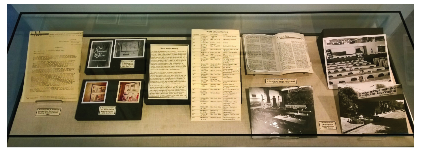
World Service Meetings Exhibit on display in G.S.O.'s Archives.