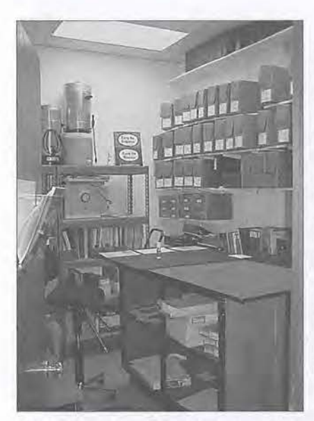
An inside view of the Northeast Ohio Area Alcoholics Anonymous Archives.

Their friendly and effective relationship did not go unnoticed. When the Akron Intergroup News Committee realized it no longer needed its room in the Intergroup Office Suite, it offered the space to general service at a modest rental. General service jumped at the chance. This not only was a good central location for our area archives' modest collection of coffee pots, office equipment, etc., but also offered us the