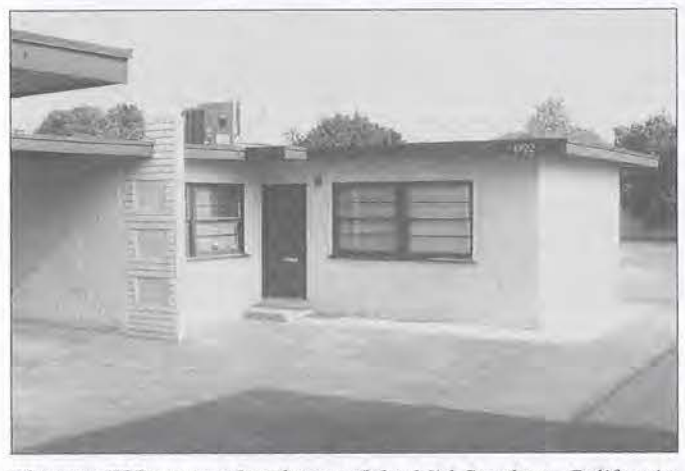
The new 700 square-foot home of the Mid-Southern California Area 9 Archives repository in the city of Riverside.

Even so, and with justification, some area members have questioned the committee's large budget, considering that only about 80 non archive members visit the repository each year. Some area members had suggested the possibility of keeping some or all of the material in storage to cut costs. Others wanted them closer to the population center in Orange County. The old location had been in the area's geographical center. One veteran service member recalled that it was moved there without much discussion at the area level.