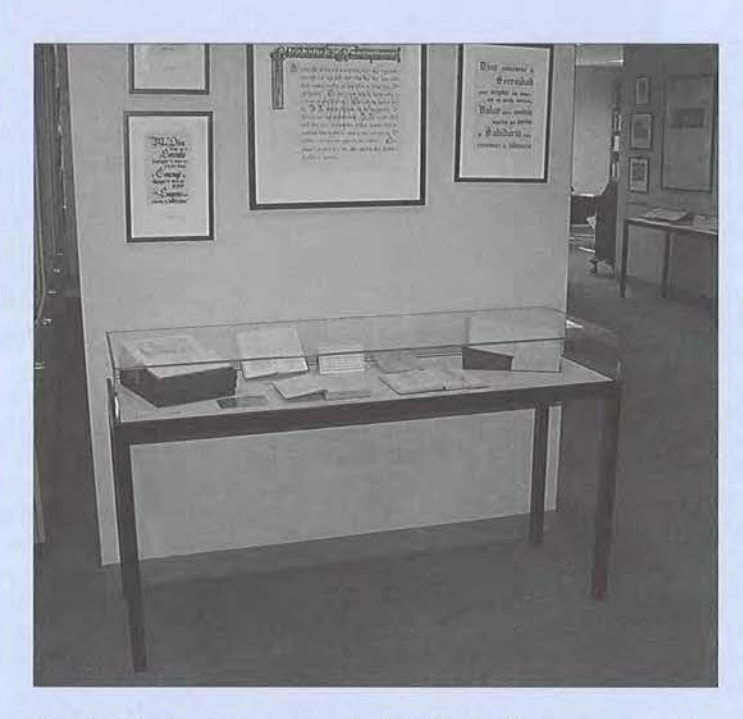
Just inside the entrance to the G.S.O. Archives is a new display case containing examples of Temperance and Prohibition literature, as well as personal drinking stories in print before 1939, the year the Big Book was published.