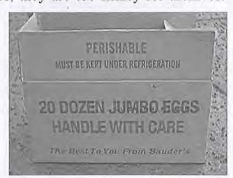
The archives' material arrived at the new repository in egg crates. When full, the boxes weighed more than 50 pounds.

Also, an egg crate full of papers weighs well over 50 pounds, too heavy for all but the sturdiest archivist. After considering archival storage boxes, we settled on legal-sized archival document cases as our standard archive box. Arrangement of material was ini-