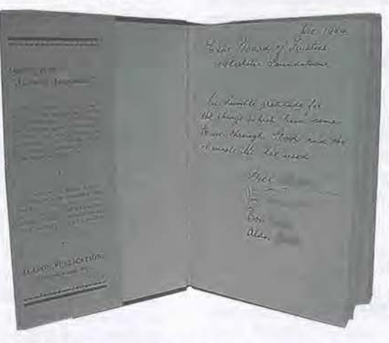
Great Britain First Edition, now in G.S.O. Archives, New York.

Who could have written a script like that? No prizes for the right answer. The fact that the discovery of the existence of one immensely important Big Book thousands of miles away, has led to the discovery of another Big Book of equal archival import, back here in Great Britain, is staggering.