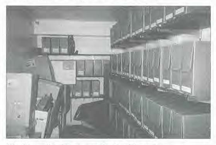
The Alcoholics Anonymous Archival Repository Area 40, Montana

Being part of A.A.'s archives is such a blessing for me and the others that help. We all work together.