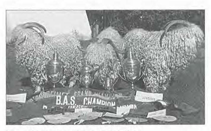
The author's prize-winning Angora Goats

I am an Angora goat farmer experiencing one of the worst droughts here in history. It seems as if our land is turning into a desert, and what a beautiful land South Africa can be when it rains. I am 59, I have farmed 40 years – Angora